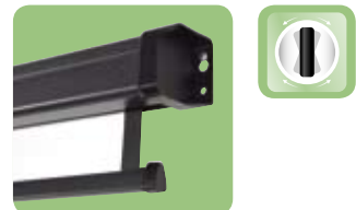
The most compact case.